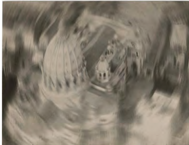
Filippo Masero Descending over Saint Peter (Scendendo su San Pietro), ca. 1927–37 (possibly 1930–33) Gelatin silver print, 24 x 31.5 cm

Many of the Futurists' paintings share congruencies with the experimental photography of their contemporaries, such as Étienne-Jules Marey and Eadward Muybridge. The depictions of movement in those montages gracefully echo Marinetti's lusty praise for "the beauty of speed." Such technical images would soon be used by industry to maximize worker productivity and efficiency, to further the mechanization of labor and the human body's effective synthesis with the factory. The study of "human factors and ergonomics," or the economical marriage of human and machine, began in the late 19th century, but exploded in the early 20th, just as Futurism was born.