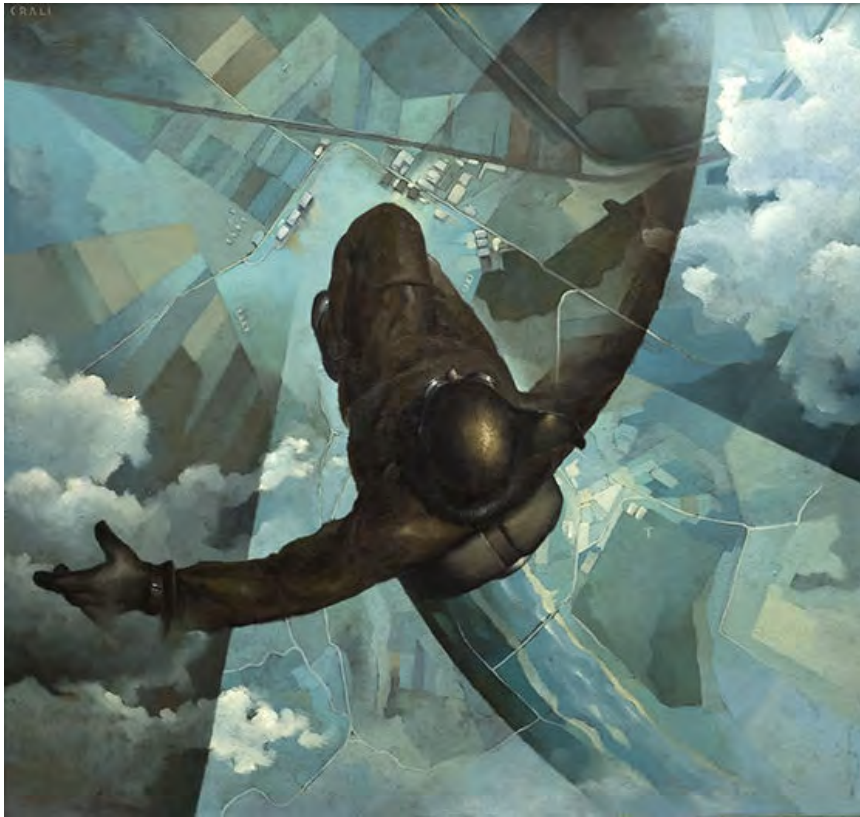
Tullio Crali Before the Parachute Opens (Prima che si apra il paracadute), 1939 Oil on panel, 141 x 151 cm Casa Cavazzini, Museo d'Arte Moderna e Contemporanea, Udine, Italy