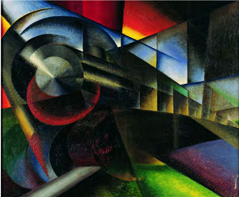
Ivo Pannaggi Speeding Train (Treno in corsa), 1922 Oil on canvas, 100 x 120 cm Fondazione Carima-Museo Palazzo Ricci, Macerata, Italy

Motors unveiled its iconic hood ornament, called “The Spirit of Ecstasy.” The small metal sculpture shows a woman leaning forward, her large dress catching the wind over her arms so that it extends as two wings. It bears an uncanny resemblance to The Winged Victory of Samothrace , the goddess of victorious warriors. And in the years to come, new mechanical inventions would first shock as cars, airplanes, machine guns, radio, mass production, and moving pictures spread almost instantly at the outbreak of war, and then integrated virtually seamlessly into the world during peacetime: as sedans, jetliners, a middle class manufacturing labor force, telephonic and televisual communications, and leisure entertainments.