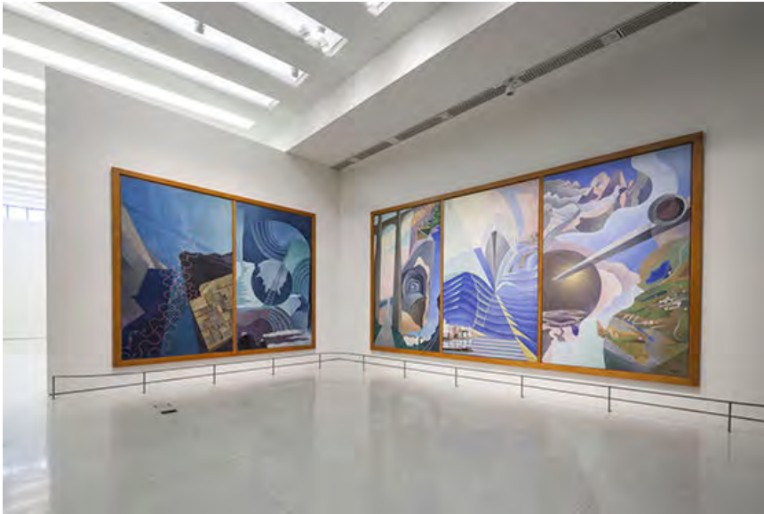
Installation view: Italian Futurism, 1909–1944: Reconstructing the Universe, Solomon R. Guggenheim Museum, New York, February 21–September 1, 2014.

influence of the rich upon the disenfranchised, a problem identified by several scholars, and especially effectively by John Berger. Many of those examples weren't intended to harm or provoke. Rather, they were accidents, or they resulted from historical biases or misconceptions and perhaps don't dampen the regard of art as a force for goodness and the spiritual, political, or emotional benefit of humanity. 1