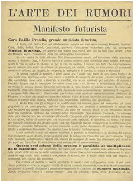
Luigi Russolo "The Art of Noises: Futurist Manifesto" ("L'arte dei rumori: Manifesto futurista") Leaflet (Milan: Direzione del Movimento Futurista, 1913), 29.2 x 23 cm Wolfsonian - Fondazione regionale per la Cultura e lo Spettacolo, Genoa By permission of heirs of the artist

happen during the subsequent years of the 20th century. 2 They demanded war and the destruction of the Austro-Hungarian Empire, which had encroached on Italian territories, put pressure on its government, and competed in trade. Within five years of Marinetti's first manifesto, Serbia's irredentist Black Hand terrorists assassinated Archduke Franz Ferdinand, an attack intended to repel the Austro-Hungarian Empire from Yugoslavia. It ushered in the most horrific war the world had seen to that point, with mechanized brutality that would result in tens of thousands of casualties every day, over and over and over for more than four years. 3 Its effects have haunted us for a century. Within nine years of Marinetti's manifesto, the Austro-Hungarian Empire was in the process of being dissolved.