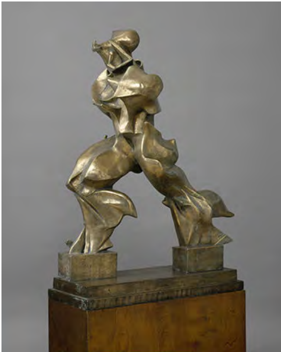
Umberto Boccioni Unique Forms of Continuity in Space (Forme uniche della continuità nello spazio), 1913 (cast 1949) Bronze, 121.3 x 88.9 x 40 cm The Metropolitan Museum of Art, New York, Bequest of Lydia Winston Malbin, 1989

email, to SMS, may appear incremental if compared to the birth of flight, to the invention of recorded sound, to the very first moving images, to the original mechanized war, which erupted 100 years ago.