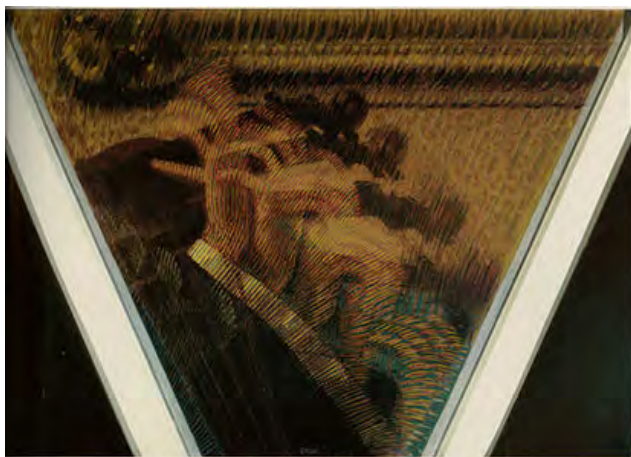
Giacomo Balla The Hand of the Violinist (The Rhythms of the Bow) (La mano del violinista [I ritmi dell'archetto]), 1912 Oil on canvas, 56 x 78.3 cm Estorick Collection, London © 2013 Artists Rights Society (ARS), New York / SIAE, Rome

This is not to say that the Futurists didn't prize art and make beautiful heaps of it. Many of their more famous works appear now to be regional derivatives of Cubism, Neo-Impressionism, Synchronism, and other forms of early 20th-century abstraction—showing Futurism's indistinct separation from other avant-garde movements of the time. 8 But there are numerous beautiful works on view.