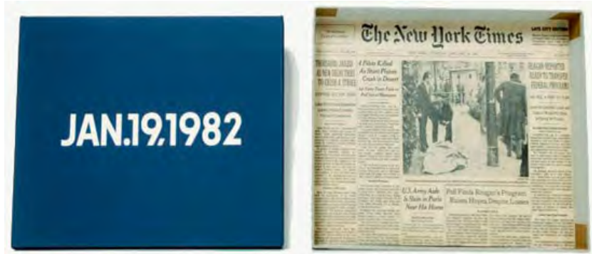
On Kawara, Jan. 19, 1982, 1982. Liquitex acrylic on canvas (with its handmade cardboard box and newspaper insert), 8 x 10 inches.

On Kawara: January 2, 1933 – July 10, 2014