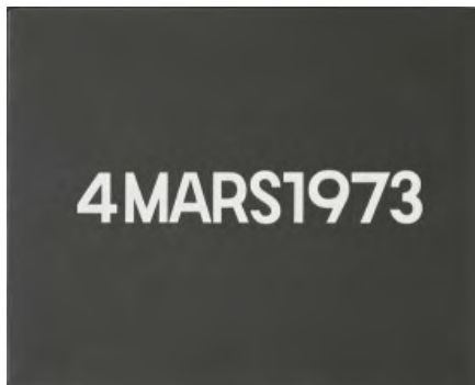
On Kawara, 4 Mars 1973, 1973. Liquitex acrylic on canvas, 8 x 10 inches.

Comedian Louis CK points out, with his characteristic ethical generosity and pragmatism, “A lot of people wonder what happens after you die. Lots of things happen after you die — just none of them include you.” The recent death of On Kawara ends the brief but significant line of a life and of an exceptionally powerful artistic contribution. Human life is a rarer accomplishment than most of us, living day-to-day, sometimes remember. Most of the world is uninhabitable. Probably far greater than 99% of the entire Universe is completely inhospitable to life. Figuring out how to organize the mind and the body into some kind of harmonious, eudaimonic state is an ongoing struggle. Just getting up each day can feel like a victory. And, after any life extends for its short span, it ends. Thereafter everything else continues in its absence. That someone lives and is known at all, is momentous.