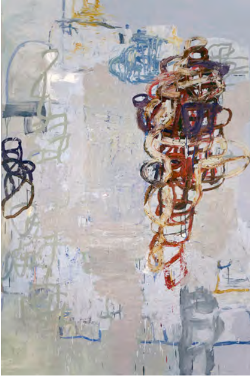
Images: Margaret Evangeline, Bridesmaid (2010), gunshot powder-coated stainless steel; Rehabilitation of Evel Knievel (2011), oil on canvas.